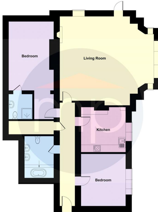
Not to Scale. Produced by The Plan Portal 2022 For Illustrative Purposes Only.

The information provided about this property does not constitute or form part of an offer or contract, nor may it be regarded as representations. All interested parties must verify accuracy and your solicitor must verify tenure and lease information, fixtures and fittings and, where the property has been recently constructed, extended or converted, that planning/building regulation consents are in place. All dimensions are approximate and quoted for guidance only, as are floor plans which are not to scale, and their accuracy cannot be confirmed. Reference to appliances and/or services does not imply that they are necessarily in working order or fit for the purpose. We offer our clients an optional conveyancing service, through panel conveyancing firms, via MWU and we receive on average a referral fee of one hundred and thirty pounds, only on completion of the sale. If you do use this service, the referral fee is included within the amount that you will be quoted by our suppliers. All quotes will also provide details of referral fees payable.